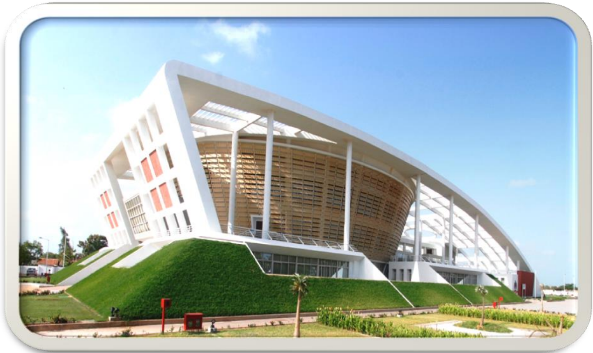
National Assembly, New Assembly Building, Reginald Pye Lane, Banjul, The Gambia